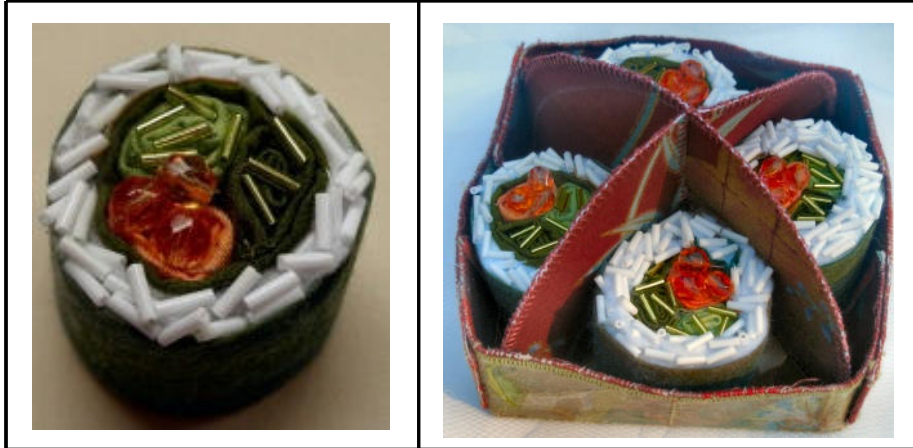
The four fushi will be held in a divided tray that fits inside the takeout box.

Bugle beads for the avocado about 40 total