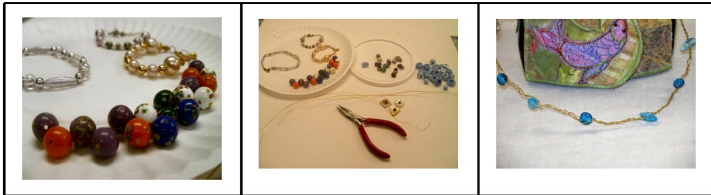
Example of beads for the handle, supplies and an alternate style wire and bead handle

Options: 2 sizes of beads-1/2 inch (diameter) or smaller assorted sized beads